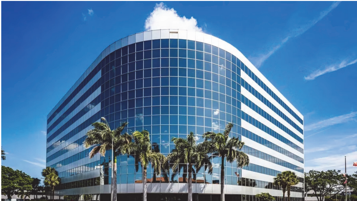
The Bridgeport Center at 5201 W Kennedy Blvd. in Tampa has sold for $40 million to a pair of investment firms based in South Florida and New York.