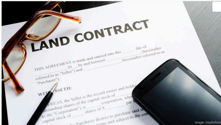
land contract MAYBEFALSE